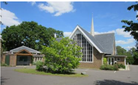
Church of the Good Shepherd