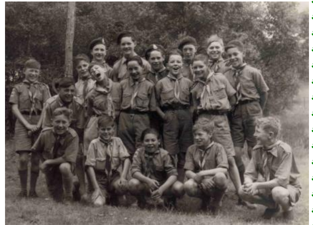
1st Byfleet Scouts. Left—summer camp at Rowlands Castle 1950. Above an undated outdoor gathering.

Some members will remember this tile picture of a fine bull which used to be on a wall in Derisley's butchers in High Road. The shop has gone only relatively recently, and the space is now the entrance to Derisley Close.