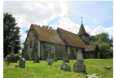
St Nicholas, Pyrford

St Nicholas Church, also dating back to the middle of the 12th century, remains essentially unaltered since that time. It has a capacity of 100, and is a popular film location. It is surrounded by a churchyard, which is now full. An extension of the burial ground is located across Newark Lane, with a hazardous crossing across the busy road between the two areas. To ease the situation, a new car park area has been created off Warren Lane. Originally the road between Pyrford and Ripley went to the west of the church, but this route involved a steep incline down to the water meadows, so the present road to the east was built.